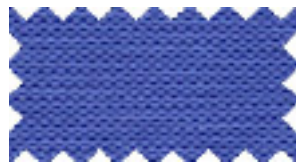
COBALT BLUE 3859