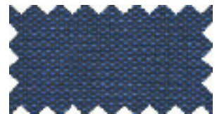
NAVY WEAVE 3851