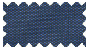
ADMIRAL NAVY 3866