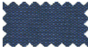
ADMIRAL NAVY 3866