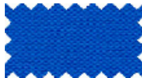
SAIL BLUE 3863