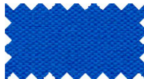
SAIL BLUE 3863