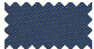
NAVY WEAVE 3851