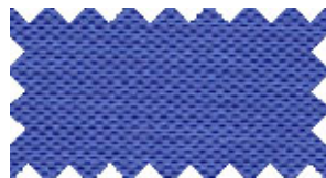
COBALT BLUE 3859